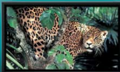
PANASONIC TH-50PF9UK 50-Inch Plasma Monitor