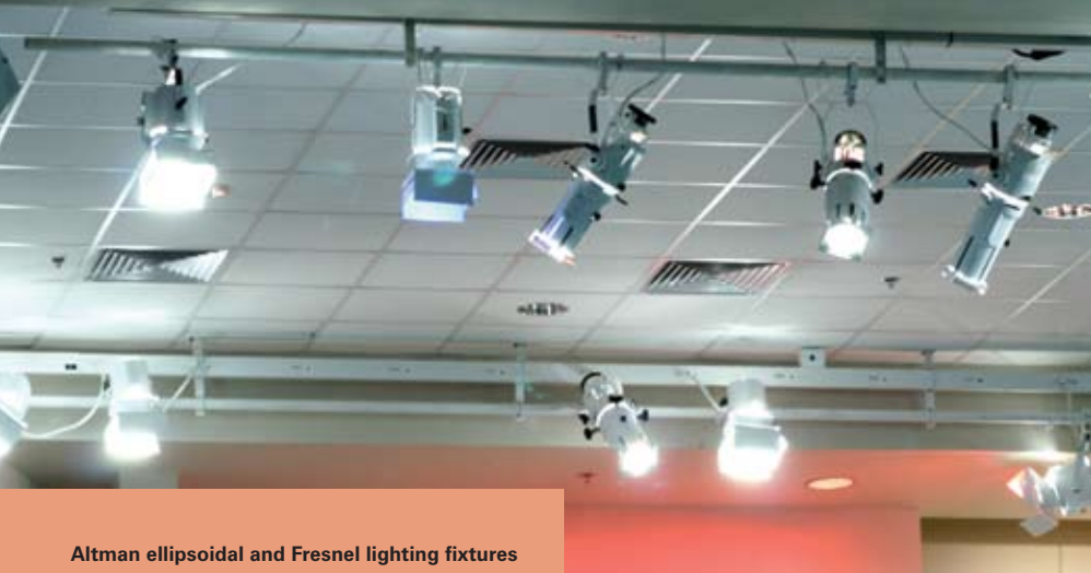
Altman ellipsoidal and Fresnel lighting fixtures illuminate the stage at Temple Baptist. White fixtures were chosen to blend in with the ceiling, posing less of a distraction.

control. We tried to find pieces of gear that not only met our specifications but that also give that piece of [control] software to the client," he recalls.