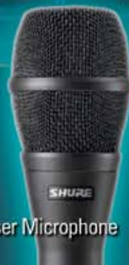
SHURE KSM9 Condenser Microphone