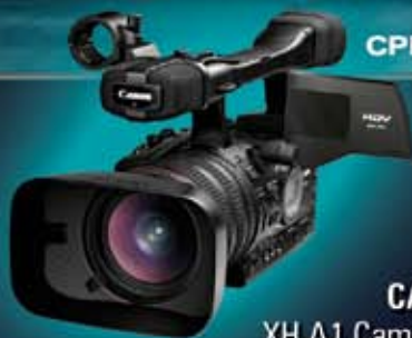
CANON XH A1 Camcorder